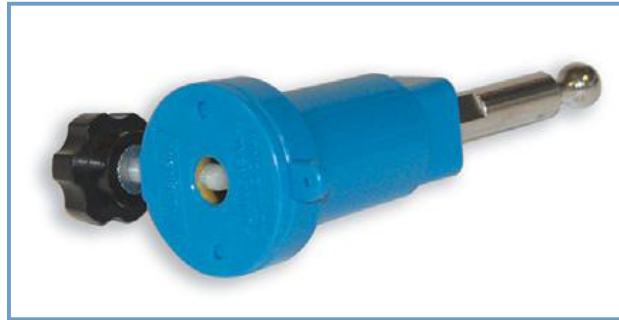
Figure 1. Example of adapter for Valleylab generators